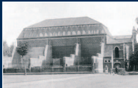
The Butterfield courts at Rugby School

In the middle of the 19th Century, the informal handball and bat games played by schoolboys began to be officially recognised in the construction of specialised courts at a number of Public Schools.