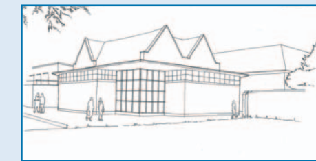
View from Caldecott's

Positioning the new Fives courts alongside the existing Squash courts will create a specific 'court games' area which we hope will help to introduce both games to new boys and girls in their early years at the School.