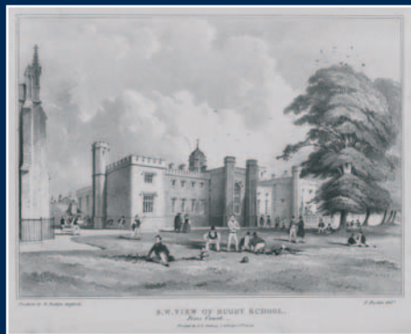
Early Fives was played against the walls around School House

...and there is an unlikely theory that early Fives involved teams of five players.